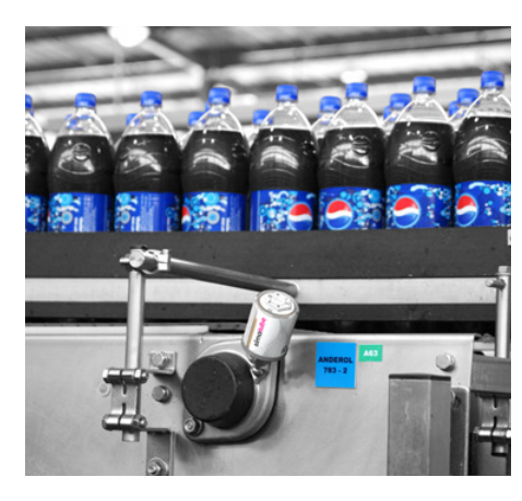
Lubrication of a flange bearing on a filling machine for soft drinks.