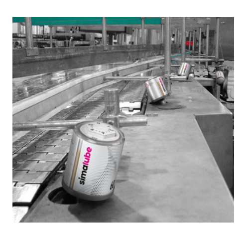
A filling line is equipped with several simulube lubricators.

«simalube lubricates continuously, extends the lifespan of the production machines and sinks maintenance costs»