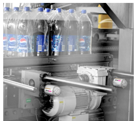
The bearing on the gear box is lubricated with two 60\,\mathrm{ml} simalube lubricators.