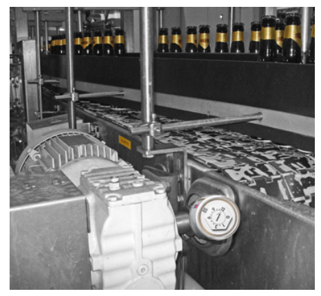
Lubrication of a transport belt with a simalube lubricator.