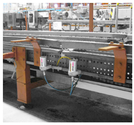
Two simalube lubricators with tube extensions lubricate a transfer chain in a brewery.