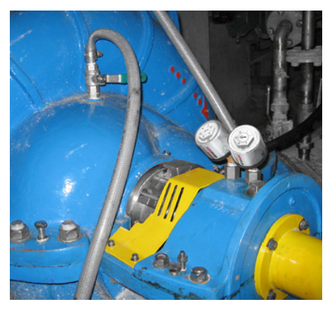
Two 30 ml simulube units lubricate the bearings of a pump.