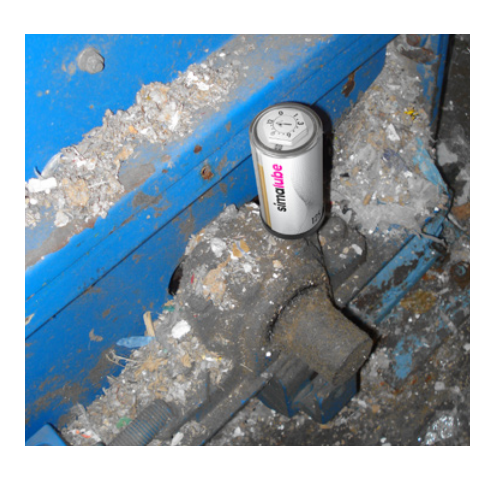
In a paper factory the pedestal bearings of a shredder are lubricated with a 125 ml simalube unit.

«Considerable savings of time and greater safety at work thanks to automatic lubrication»