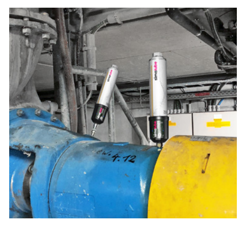
The bearings of the pump are lubricated with two IMPULSE and 250 ml simalube units.