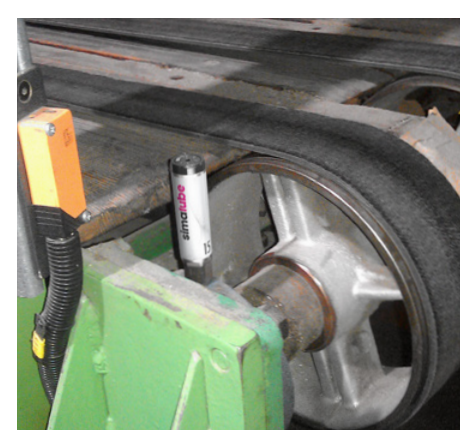
The bearings of the transport belts in a corrugated cardboard factory are continuously lubricated with the simulube lubricator.