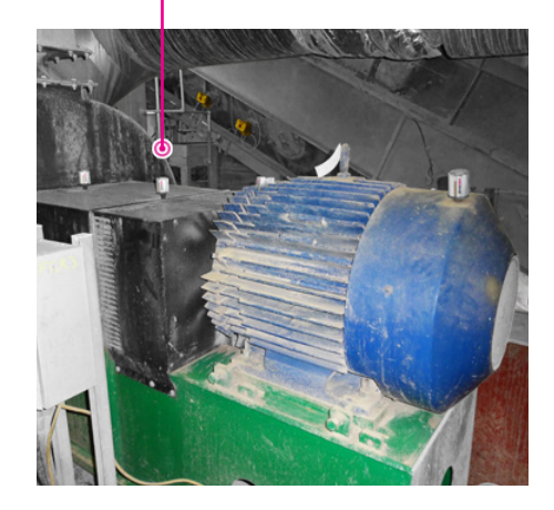
The FGR ventilator is lubricated by simalube 60 ml.