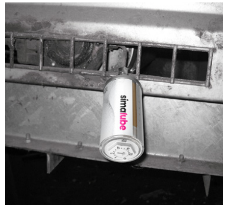
simalube lubricates bearings on a conveyor belt.