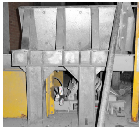
A vibrating conveyor lubricated by several 125 ml simalube lubricators.