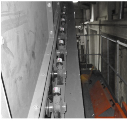
Dozens of 30 ml simalube lubricators provide the bearings of a conveyor belt with the necessary lubricant.