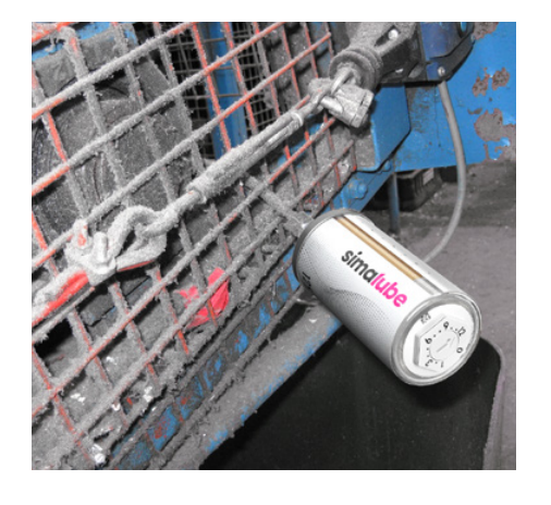
The externally installed simalube prevents dirt from entering the lubrication point.

«simalube increases employee safety in factories»